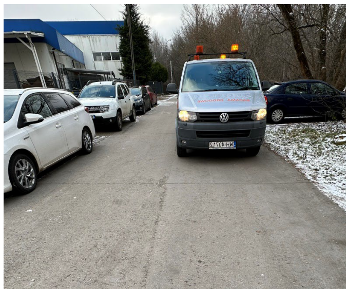
Fig. 3. Roller-compacted concrete pavement in the course of Jesiotrowa street in Warsaw