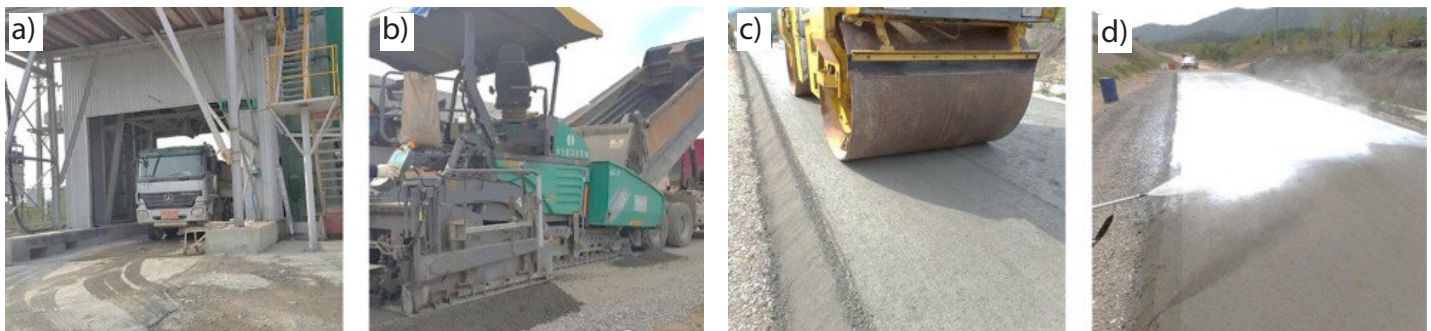
Fig. 1. Production process of RCC: a) mixing and transport, b) paving, c) compaction, d) curing [8]

Figure 1 shows the production process of RCC [8].