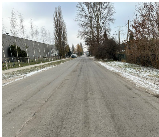
Fig. 2. Roller-compacted concrete pavement in the course of Inowłodzka street in Warsaw

considered as a solution that guarantees longer pavement life at a relatively low construction cost. The pavement made with RCC technology has a lifespan of at least 30 years, plus the maintenance costs of such a pavement are very low. This technology reduces costs by several percent compared to a bituminous road of the same category. The availability of the equipment used for the construction of municipal roads (asphalt pavers, rollers) also argues in favour of using this technology for the construction of municipal roads.